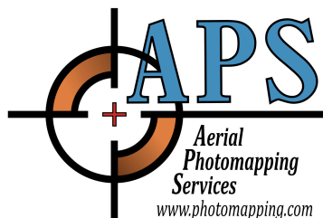
Aerial Photomapping Services