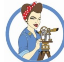
Women Surveyors Summit July 28-31, 2022

The Women Surveyors Summit is back and in person for 2022! This year the 3rd annual summit will be held in Williamsburg, VA. The Summit is scheduled for July 28-31, 2022.