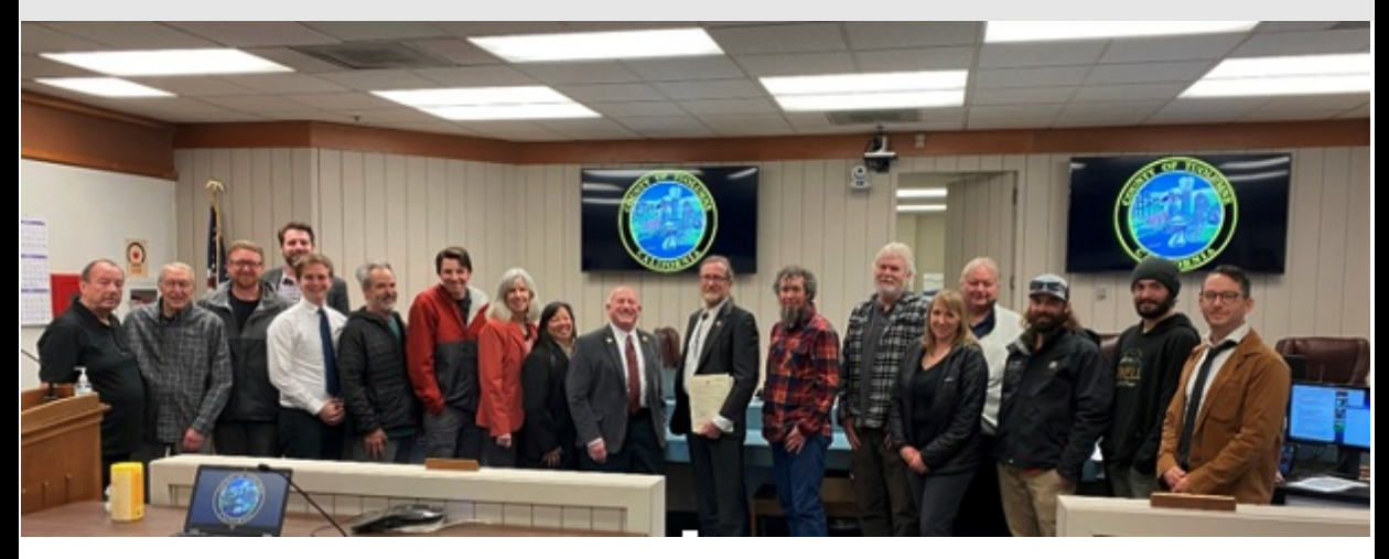
Photo above: Tuolumne County Board of Supervisors meeting March 15, 2022

Each of the following resolutions recognizes the week of March 20 through the 26, 2022 as National Surveyors Week.