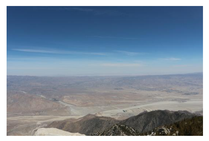
Try to identify the location of this month's photo. Submit your answer to: Rob McMillan.

looking east towards the dam. Luz reported that her coworkers brainstorm the location together over lunch on the day the CLSA eNews is released. Also correctly identifying the location was Bill Tuck, PLS with the City of Oceanside. Both win a beverage at the next conference.