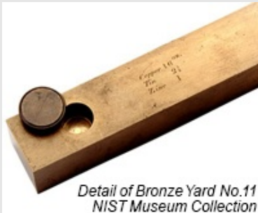
Detail of Bronze Yard No. 11 NIST Museum Collection