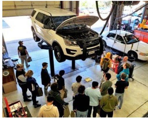
Students visited the County Garage, where fleet vehicles are maintained.

Hosted by DPW and planned in conjunction with the Marin County Office of Education, the field trip introduced the students to a wide range of disciplines that fall under the purview of public works. It was the first time in recent decades that an extensive Public Works tour was organized for students.