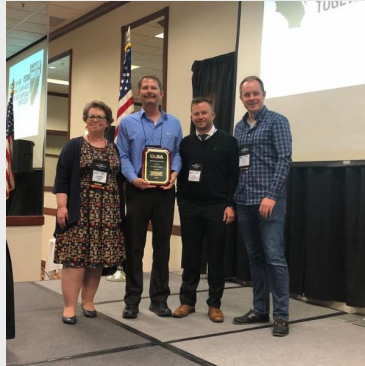
CLSA Los Angeles Chapter CLSA Chapter of the Year