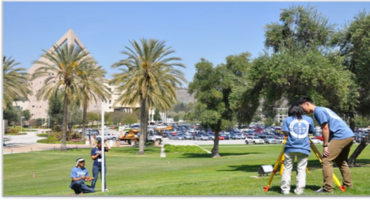
CAL POLY POMONA GEOMATICS CONFERENCE SEPTEMBER 20, 2018