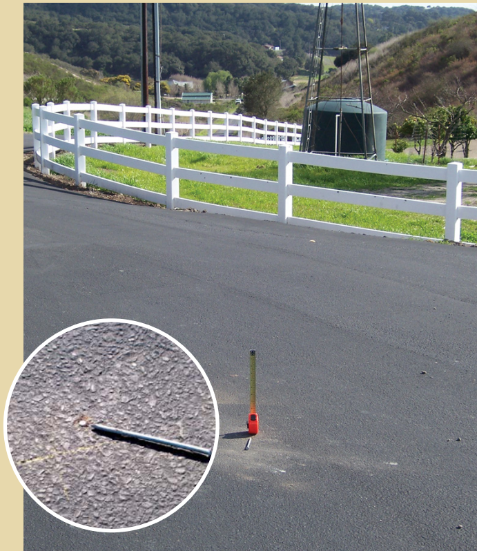
An informational brochure of California Land Surveyors Association © 2016 CLSA

Note: These excerpts from California law have been edited to provide relevant portions in a limited space. You must refer to the complete text of the statutes and laws for full meaning and context.